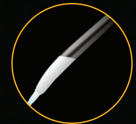
Curved handpiece design

Curved handpiece design provides better access to the posterior in multiple positions and reduces fatigue during longer procedures.